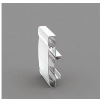
Roy Profili Rail Profile