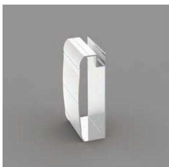
Duvar Dikmesi Wall (side) Profile